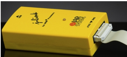
ARM JTAG debugger

Heeltoe worked on several PowerPC, NIOS and ARM projects in 2008. We wrote a NIOS simulator, brought up a PPC440epx dual CPU design with gigabit Ethernet and helped with an ARM/NIOS video camera design. We also worked on a DO-178B avionics design, adding new functionality and documentation.